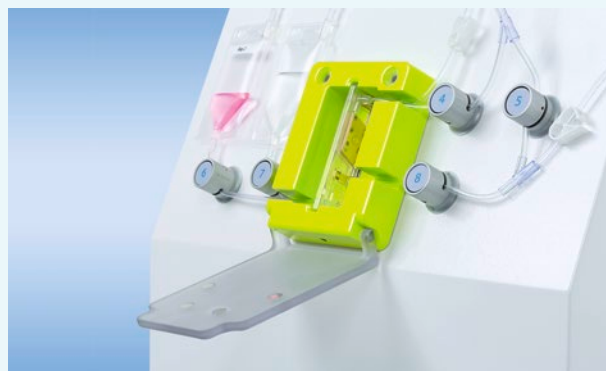
Figure 2: Critical steps in the cell manufacturing process, including electroporation, are performed in the closed system of the CliniMACS Prodigy.

A variety of cell manufacturing procedures are made possible by the CliniMACS Prodigy, including: